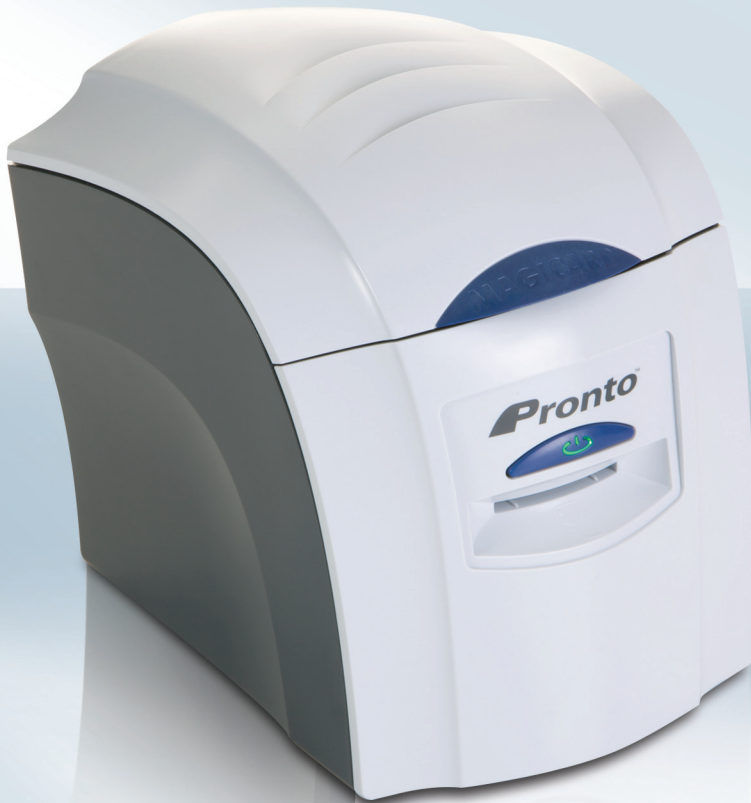
Normal full color printing

Simply the best value secure ID card printer